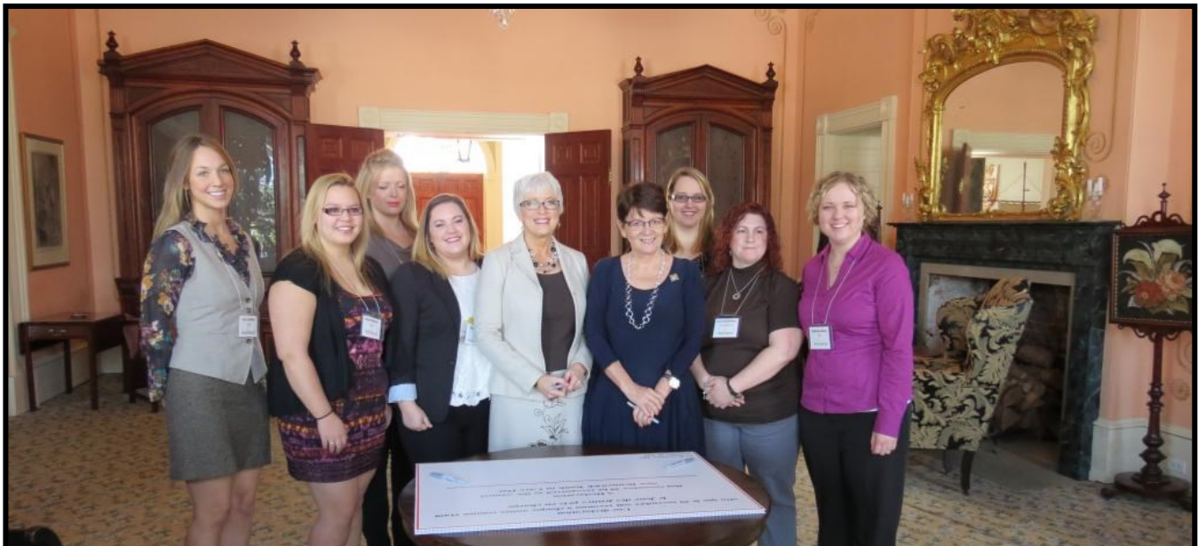
1st annual New Brunswick Children and Youth in Care Day: A celebration to remember; a day to never forget!

The Fall months of 2014 were some of the busiest for the NBYICN. We organized and attended launches, led province-wide events, and shared our stories and expertise with new audiences! Read on to find out about our work over the last few months, and some of the AMAZING events that we've got lined up for 2015. (We are going to be really busy this year too!)